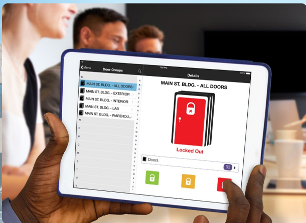
Instantly lock-down your building from anywhere.